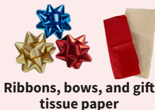
Ribbons, bows, and gift tissue paper