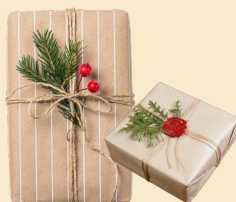
Kraft wrapping paper and newsprint-based wrapping paper (plain wrapping paper with no foil or glitter)