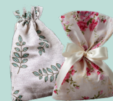
Drawstring pouches and pillowcases