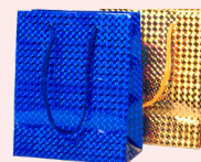
Gift bags containing foil, Mylar, or glitter (keep for reuse; throw away when ripped)

More Holiday Tips: Reduce holiday waste by following the tips below!