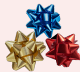
Ribbons, bows, and gift tissue paper