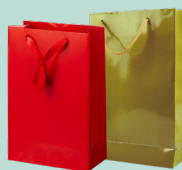
Reusable bags and boxes

(also recyclable; remove handles and non-paper materials before recycling)