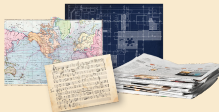
Recyclable papers (for example: newspaper, magazine pages, posters, calendar pages, maps, blueprints, sheet music, etc.)