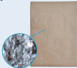
Paper padded mailer (padded with paper fibers)