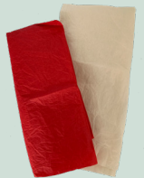
Gift tissue paper (no glitter, tape or non-paper content)

* Envelope rip test: Rip the envelope - if the fibers inside are white, RECYCLE it! If the fibers inside are colored, COMPOST it!