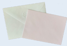
Plain paper mailers and pastel-colored envelopes (If envelope is colored, try the rip test*)