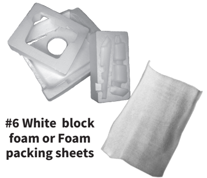
#6 White block foam or Foam packing sheets