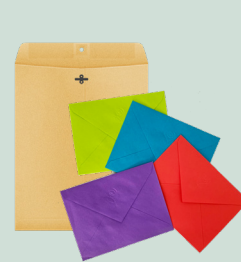
Dark or bright paper envelopes*