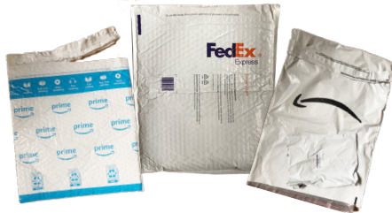
Plastic mailers (unlined, or lined with bubble wrap)