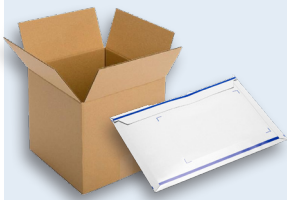
Cardboard boxes and paper only envelopes (remove any plastic sleeves on the mailer)