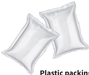
Plastic packing "pillows"