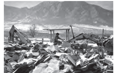
Eco-Cycle started curbside recycling in Boulder in 1976, making the city one of the first in the nation to offer curbside recycling.