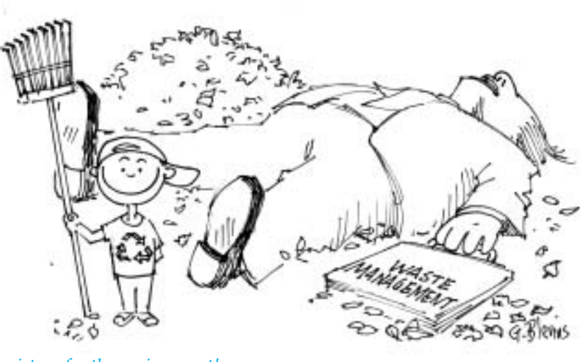
A victory for the environment! The Coalition to Oppose Attacks on Recycling in America thwarted an effort by the landfill industry to repeal an Iowa law that keeps methane-producing grass clippings and leaves out of the landfill.

to regain revenues lost to recycling and composting, the landfill industry is promoting and investing hundreds of millions in bioreactor technology - a technology that would send more and more organics to landfills.