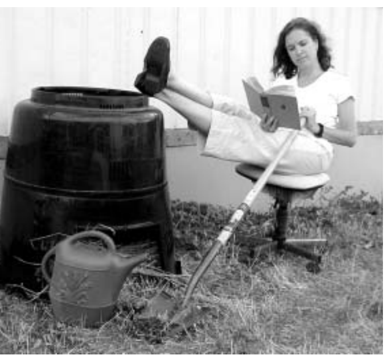
Composting may seem like an activity reserved for the scientifically inclined, but worry not, poetry majors; there is a non-scientific approach that leaves you plenty of time for life's other activities.

Buy a bin or build one with four pallets placed on end and wired together. A bin is key to passive composting. If you just use a pile instead, you'll get weeds growing in it and therefore weed seeds when