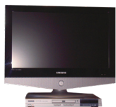
TVs, VCRs & DVD Players, Satellite Boxes