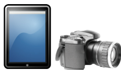
Tablets & Cameras