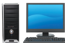
Laptops, Computers & Monitors