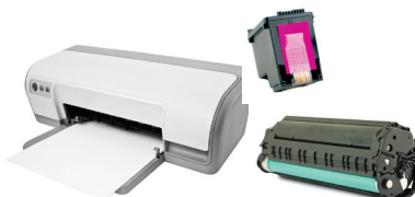
Printer/Copy Machines, Fax Machines, Printers & Printer Cartridges