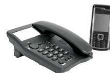
Mobile Phones, Office Phones, Home Phones