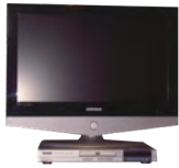
TVs, VCRs & DVD Players, Satellite Boxes