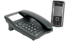
Mobile Phones, Office Phones, Home Phones