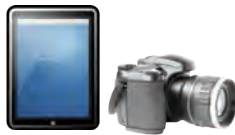
Tablets & Cameras