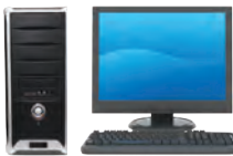
Laptops, Computers & Monitors