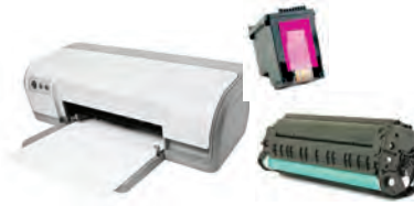
Printer/Copy Machines, Fax Machines, Printers & Printer Cartridges