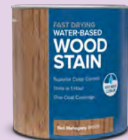
Stain Tinte de color