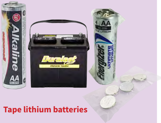
Tape lithium batteries