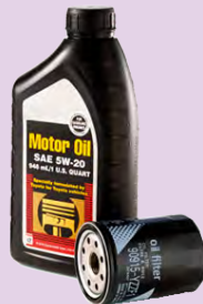
Motor oil Aceite para motores