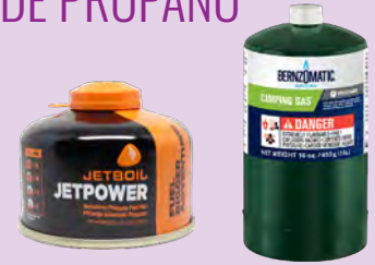
Propane cylinders 1 lb and under only Solo cilindros de propano de 1 lb o menos

The following materials should be disposed of in the TRASH , not taken to the Hazardous Materials Management Facility.