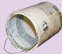
Used plastic paint cans