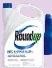
Weed spray Fumigador de maleza