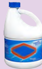
Bleach Detergente líquido blanqueador