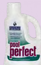
Pool cleaner Limpiador de piscinas