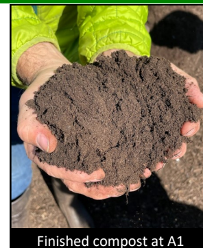
Finished compost at A1

Compost reduces organic materials landfilled and creates valuable soil amendments for local farmers and gardeners. Composting is one of the easiest and most effective first steps you can take to reduce greenhouse gas emissions, specifically methane, which is generated when our food and organic waste is landfilled. However, what we put in the compost bin needs to actually be compostable in order to create clean and usable compost.