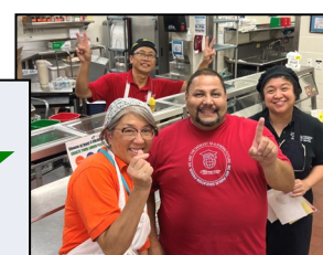
Blue Mountain (SVVSD)