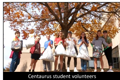
Centaurus student volunteers