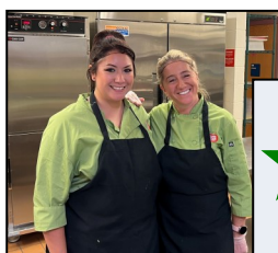
Ryan Elementary (BVSD)

This fall, BVSD kitchens have diverted 31,370 lbs of clean compost from the landfill!