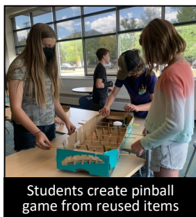
Students create pinball game from reused items