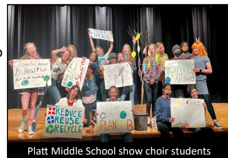
Platt Middle School show choir students

During the captivating show, through dialogue, song, and dance, a group of young climate activists convinces climate naysayers, to care about the environment. At the end of the show, the group showcased their tree of commitments, each leaf representing actions students promised to take such as reducing shower times, biking instead of driving, and other ways to better our environment.