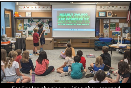
EcoEagles sharing a video they created about Colorado energy use

Eisenhower Elementary's EcoEagles Green Team entered the Resource Central SPARK Renew our Schools Competition last spring. The EcoEagle EcoAmbassadors learned about the sources of Colorado's energy, including fossil fuels and renewable sources. Using handheld meters, students took energy measurements around the school in order to improve efficiency and reduce their energy use. With their hard work and dedication, they placed first in the competition, earning a prize worth $2,000: the installation of an energy gauge!