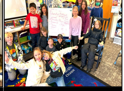
LMS: Pirates for Climate Action Club