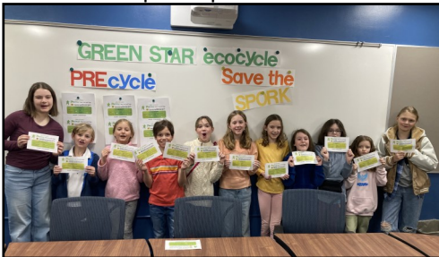
Central Elementary's Student Council stands with their Waste-Free Lunch Pledges!

This Spring, 8 Green Star Schools participated in Eco-Cycle's Waste-Free Lunch: Precycle promotion, which encourages students to reduce, reuse, recycle, and compost to reduce waste at lunch. BCSIS, Central Elementary, and Horizons K-8 were the lucky winners of the cash prize drawing. A few schools also participated in the Bonus Reusable Utensil