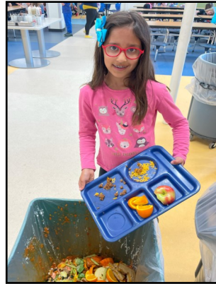
Birch student composts food scraps

There are currently 66 Green Star Schools in Boulder and Broomfield Counties. Eco-Cycle's Green Star Schools program is looking forward to continued collaboration with existing Green Star Schools, as well as the enrollment of new schools!