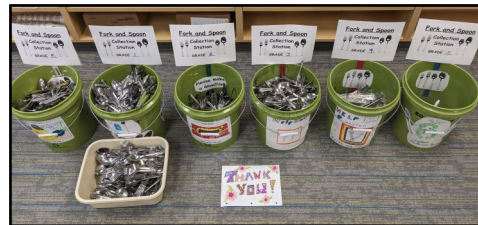
Eisenhower Elementary utensil drive collection

The Eisenhower EcoEagles were invited to a BVSD Board of Education meeting in honor of Earth Month. Fifth grader, Lily Bradshaw, detailed their fork & spoon donation competition, in conjunction with Eco-Cycle's Waste Free Lunch promotion.