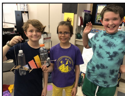
"Trash to Treasure" bird feeders

Eagle Crest Elementary's 4 th grade students participated in Recycle Colorado's "Trash to Treasure" poster contest! They studied this year's Earth Day theme, planet vs. plastics, and generated questions after learning facts about plastic pollution. Inspired to up-cycle plastics, they created useful items such as clothing, chairs, drawers, bird feeders, gardening sets (watering can, seed and soil containers), games, and posters. Students had a blast using their imaginations, making a positive impact, and creating useful items and beautiful art!