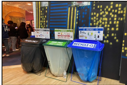
Centaurus High After Prom Zero Waste Station

At Centaurus, Boulder, and Fairview High Schools , volunteers reduced waste at After Prom events by ensuring discards were sorted right, partnering with Eco-Cycle which loaned Zero Waste Event supplies!