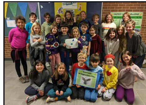
EcoEagles Green Team!

At the Board Meeting, EcoEagles also highlighted their efforts in fundraising for Walk and Roll days, collecting hard to recycle items, promoting Recycle Colorado's Poster Contest, and creating Zero Waste Party kits for all classrooms. The EcoEagles told the board, "What green teams do is important because the Earth needs more help than ever before."