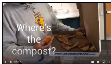
Rillo and Pizza