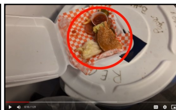
Food in the Wrong Place