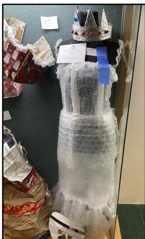
A display of the award-winning garment for the Trashion Project

Sunset Middle School art classes embarked on an eco-conscious journey with their Trashion Project to celebrate Earth Day. Through innovative design and creativity, students explored the intersection of art and sustainability, repurposing discarded materials into stunning fashion statements. From juice pouches and chip bags turned into chic accessories to repurposed newspapers, magazines, and bubble wrap transformed into award-winning garments, budding artists honed their artistic skills and learned the importance of environmental stewardship. Join us in celebrating their ingenuity and commitment to a greener future!